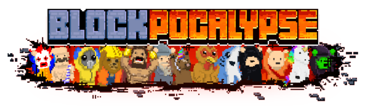
Blockpocalypse is a local multiplayer party platformer about surviving with friends in the apocalypse...or at least outliving them. Fighting their way across the apocalyptic 2D landscape, up to 4 players must forge a path in the debris, using whatever they have at hand, including blocks, clocks, and even a unicorn or two!